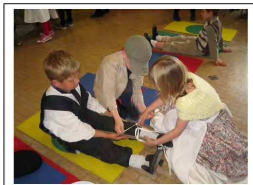
The children finding out about Florence Nightingale